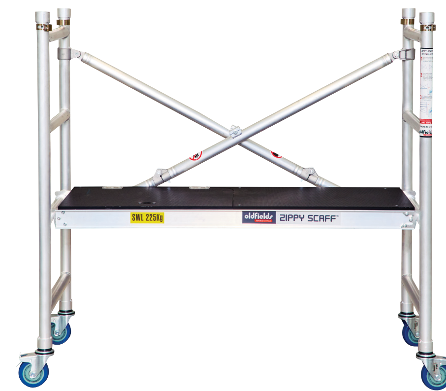
BASE UNIT Platform Height: 0.8m Reach Height: 2.8m BASE UNIT SKU: AL-FSHA-M