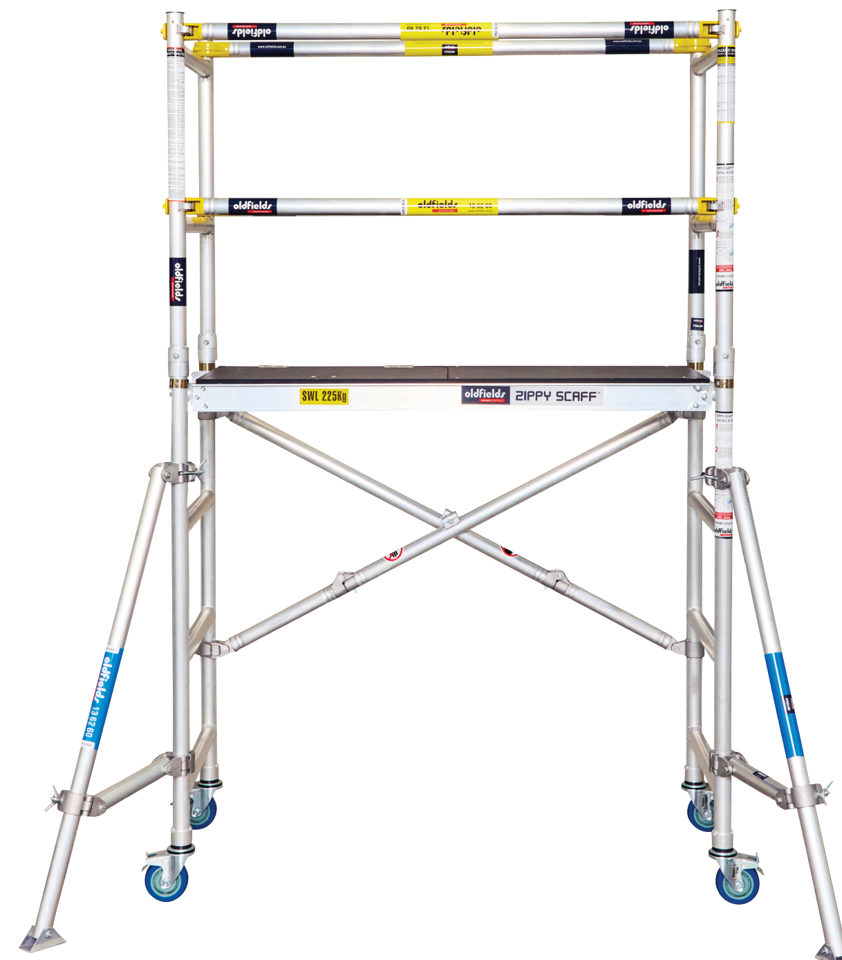
BASE UNIT & GUARD RAIL PACK Platform Height: 0.8m - 1.5m Reach Height: 2.8m - 3.5m BASE UNIT SKU: AL-FSHA-M GUARD RAIL SKU: AL-FSXP-M