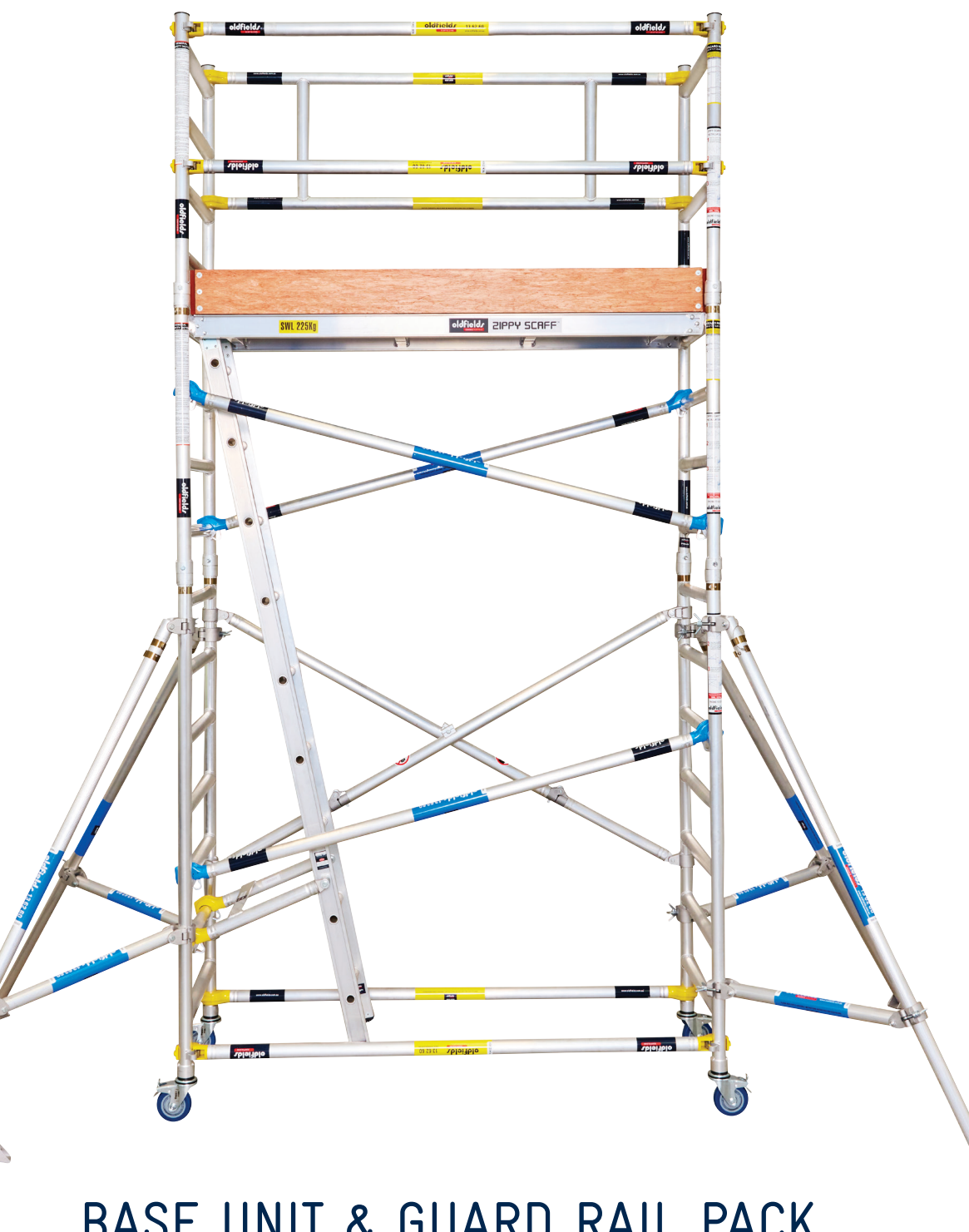
BASE UNIT & GUARD RAIL PACK WITH 1 X 1M EXTENSION Platform Height: 1.2m - 2.9m Reach Height: 3.6m - 4.9m BASE UNIT SKU: AL-FSHA2 GUARD RAIL SKU: AL-FSXP2 EXTENSION PACK SKU: AL-FSXP29