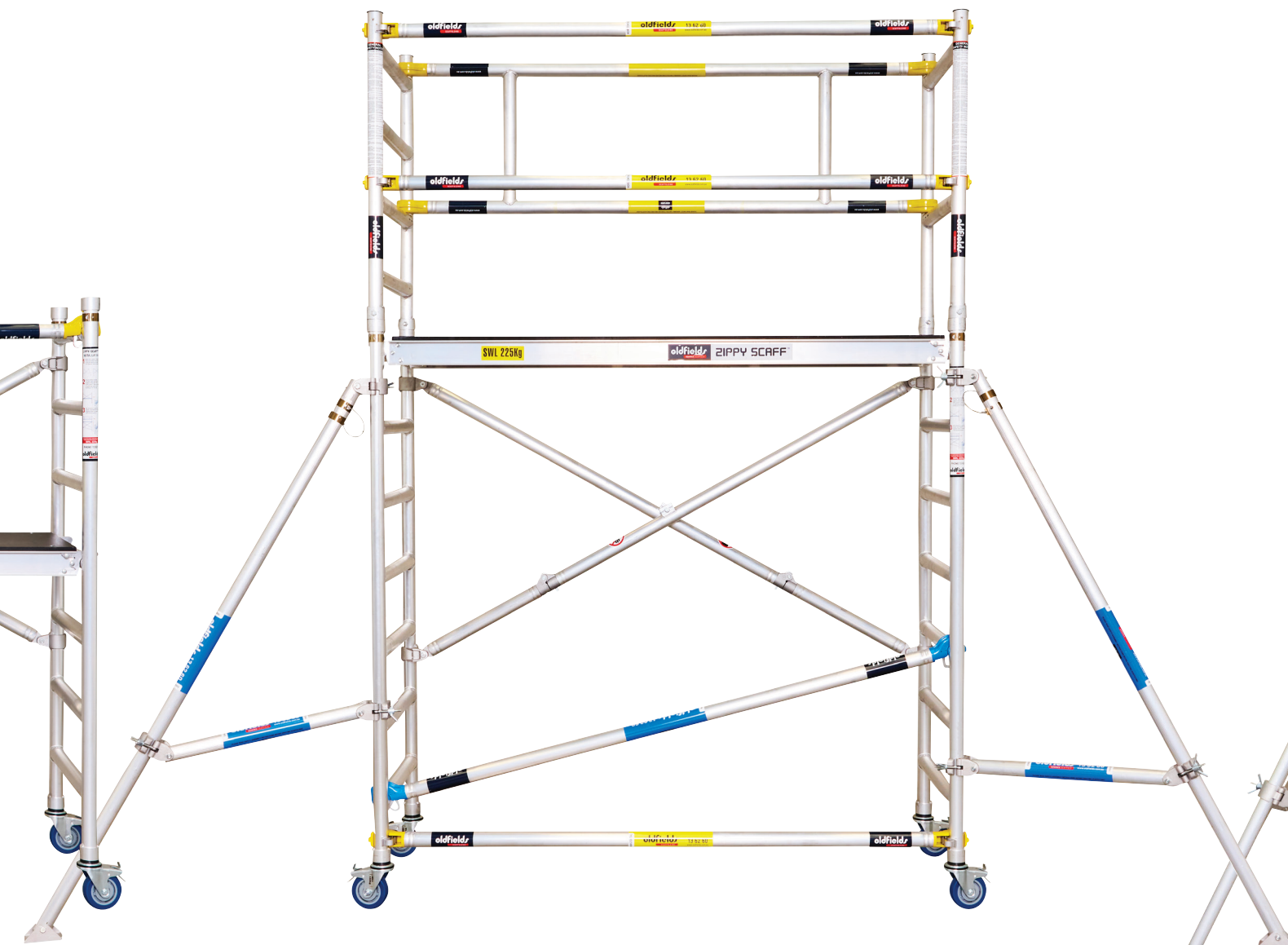
BASE UNIT & GUARD RAIL PACK Platform Height: 1.2m - 1.6m Reach Height: 3.6m - 3.9m BASE UNIT SKU: AL-FSHA2 GUARD RAIL SKU: AL-FSXP2