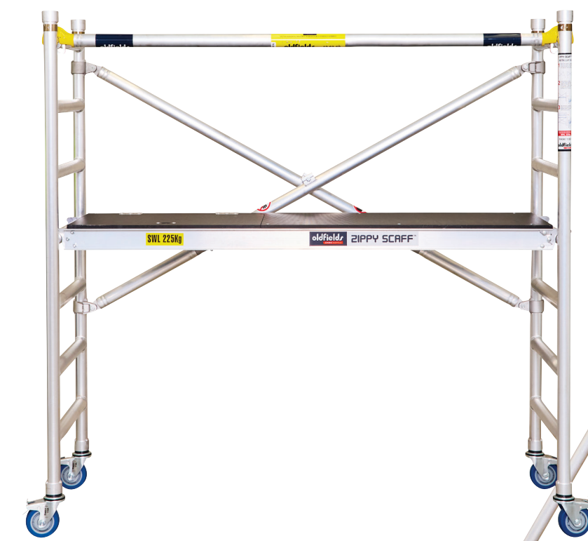
BASE UNIT Platform Height: 1.2m Reach Height: 3.2m BASE UNIT SKU: AL-FSHA2