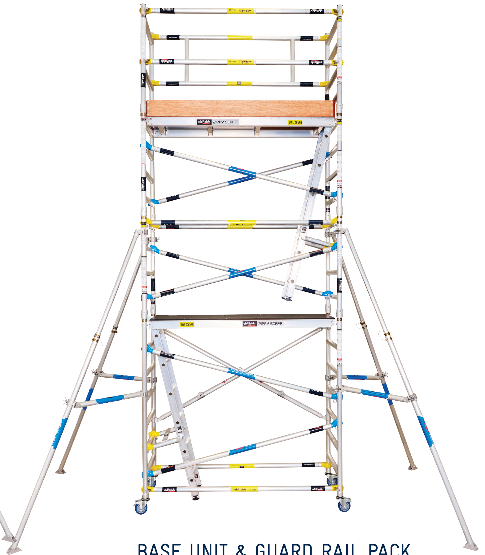
BASE UNIT & GUARD RAIL PACK WITH 2 X 1M EXTENSION Platform Height: 1.2m - 3.9m Reach Height: 3.6m - 5.9m BASE UNIT SKU: AL-FSHA2 GUARD RAIL SKU: AL-FSXP2 EXTENSION PACK SKU: AL-FSXP29 EXTENSION PACK SKU: AL-FSXP39